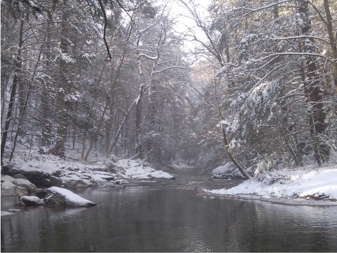
Otter Creek in the Winter

The Mason-Dixon Trail System/York Hiking Club Thursday work crew just finished four years of work upgrading the trail network at Otter Creek. The trails in the Otter Creek gorge are beautiful. There are several different loops of various distances that one can hike. The blue M-DTS is part of the KTA Super Hike.